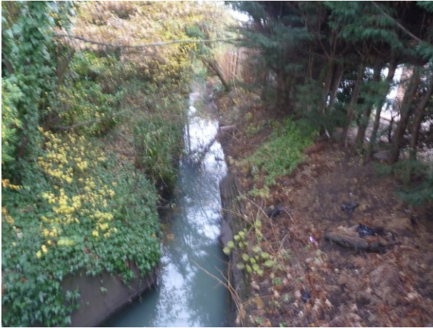
East side of Coombe Road Coombe Brook just “appears’