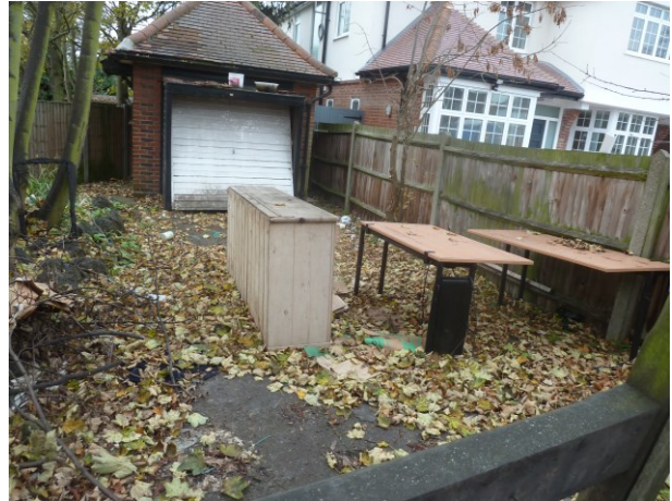
West Side of Coombe Road No sign of the Brook

Well, I thought, there is no west part of the brook now but what if there was? I recalled some old maps indicating the brook running west. So I took a detour along the streets west of Coombe Road and Traps Lane and there, on the corner of Carlton Road and Langley Grove I found the building in the picture.